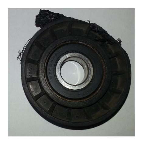
Fig. 13. The sample failure of multi-groove pulley tensioners

The most common reasons of multi-groove pulley tensioner failures (fig. 13) are: