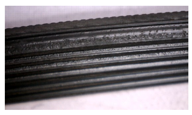
Fig. 8. The uneven wear of the belt ribs

- The uneven wear of the belt ribs. This kind of wear (fig. 8) is indicated by the damage of the sides of the tie, usually in a form of broken cord or ragged belt ribs. Other indicator of this state of belt is a rumbling or scraping sound in the transmission. The cause of this form of damage may be a foreign matter i.e. a small stone on the pulley. If nothing is done when these symptoms occur then it may result in the uneven wear of the belt, cutting the material of the belt ribs to the cord and eventually lead to its breaking.