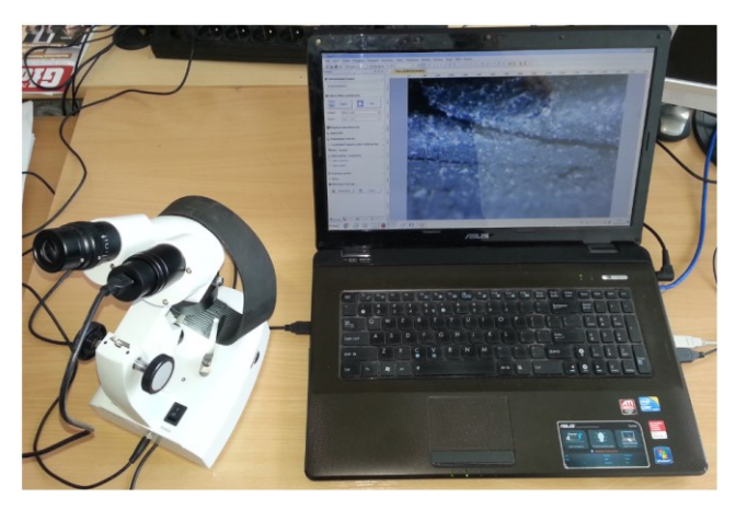
Fig. 2. Optical microscope with the measurement set

Due to their properties and low production costs V-belts and multi-groove belts are widely used in many branches of industry. Their properties were also a starting point for development research conducted by research centers and belts producers. There are a few areas of research of V-belts and multi-groove belts such as: material, construction, production technology [3]. The issues concerning the designing of integrated V-belts are presented in articles [4-5]. The issues concerning the evaluation of properties of V-belts and multi-groove belts are presented in articles [6-9]. This article tries to present the evaluation of belt transmission used in alternator drive of engine of VW Transporter T4 1.9D. Multi-groove belts, poly-V belt pulleys and belt tensioners. The evaluation of wear of belts, tensioners' pulleys was done with the use of optical microscope Bresser BIOLUX ICD BINO 80x LED with camera CMOS 2 MP (fig. 2).