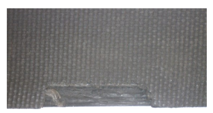
Fig. 6. The friction wear of multi-groove belt

- Friction wear. The symptom of friction wear (fig. 6) is a shinny outer surface of the belt. If there is a severe wear of the belt then on its surface a piece of fabric may be visible. This state of wear may be caused by a direct interaction of the belt with an object on its way such as a flange or a screw. Other reason of appearing the friction wear may be the incorrect tension of the belt.