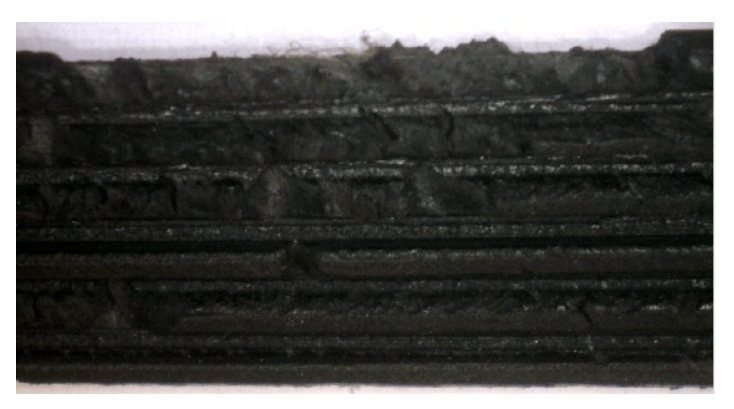
Fig. 7. The damage of the external belt ribs

The other symptom of such failure is bending or twisting of the belt Chile transmission works.