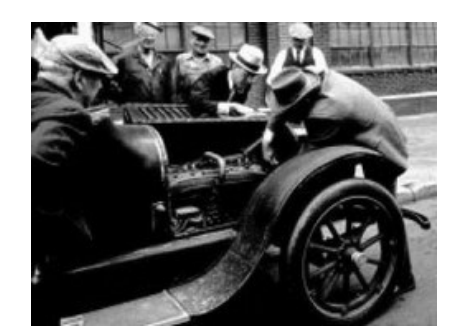
Fig. 1. The car in which V-belt was used for the first time [2]

One of the first described applications of a rod was constructing a universal machine [1]. It was a basis to construct many other machines in Egyptian times i.e. first versions of turning lathe, transporting machines, etc. The beginning of using V-belts dates back to 1917 when John Gates used them in a car powertrain (fig. 1).