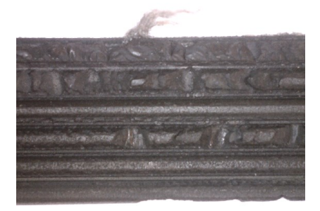
Fig. 10. The band separation

- The band separation. This problem occurs when the outmost belt ribs start separating from the rest of the material (fig. 10). When this process lasts longer then the whole rib separates and causes the damage to the fabric and another belt ribs. The reason of such state of the belt is the improper assembly of the transmission. Due to the improper assembly one or more belt ribs is beyond the groove on the pulley what causes lack of corelation of belt sidewalls that lowers significantly the duration of proper transmission work.