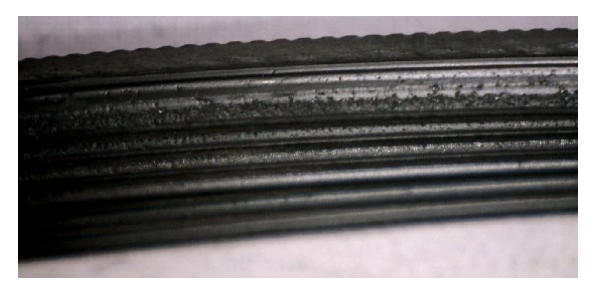
Fig. 5. Peeling phenomenon on multi-groove Belt

- The phenomenon of peeling. Peeling occurs (fig. 5) when the material of the belt is rubbed off the tops of the ribs and accumulates in its grooves. One of the reasons of such situation may be the improper tension of the belt, assembly mistakes or the wear of pulleys. This phenomenon is common for the belt drives of engines propelled by petrol or diesel oil.