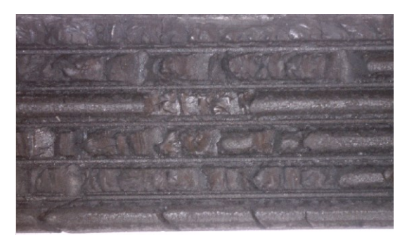
Fig. 4. Rubber flaking in multi-grove belt

- Belt rubber flaking. When rubber flakes (fig. 4) then the belt may break immediately. Such state of the belt may be the result of many cracks cumulating in one place which are parallel to the cord strand. Such state of belt is caused by high temperature, the duration of using the belt and belt tensions.