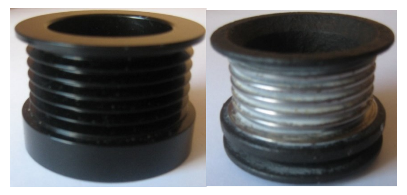
Fig. 12. New pulley and pulley exploited for about 250000 km