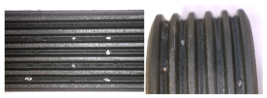
Fig. 9. The influence of contaminations on poly-v belt

- The band separation. This problem occurs when the outmost belt ribs start separating from the rest of the material (fig. 10). When this process lasts longer then the whole rib separates and causes the damage to the fabric and another belt ribs. The reason of such state of the belt is the improper assembly of the transmission. Due to the improper assembly one or more belt ribs is beyond the groove on the pulley what causes lack of corelation of belt sidewalls that lowers significantly the duration of proper transmission work.